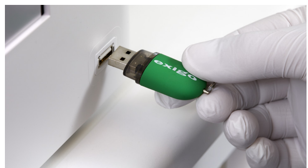
Improved connectivity with a front-panel USB port.

New Exigo H400 is fully-equipped to meet new ways of communicating. It features a host of connection possibilities for printers, keyboards, barcode readers, USBs etc. This better connectivity includes HL7 industrial standard protocol, together with the previous XML protocol. LIS connection via a LAN port. Furthermore, this improved connectivity is very easy to use, as the front-panel USB port demonstrates.