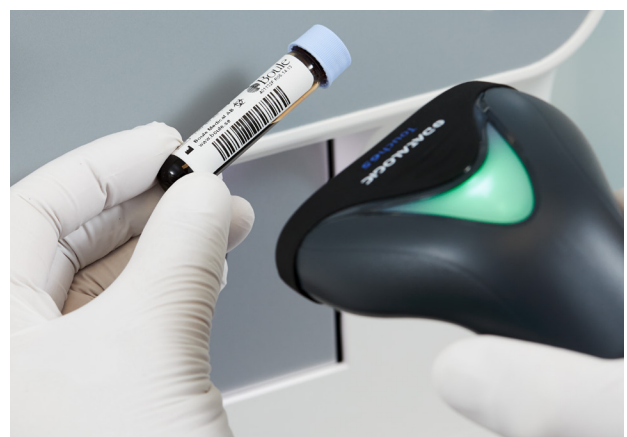
No hematology testing system is complete without a quality control program.

Every veterinarian, as well as their patients, should be able to trust their analyzer and depend on its results. That's why a full QC system has been designed into Exigo H400 software. And with barcodes for handling and registering controls and their assay values, it's both simple to use and 100% secure.